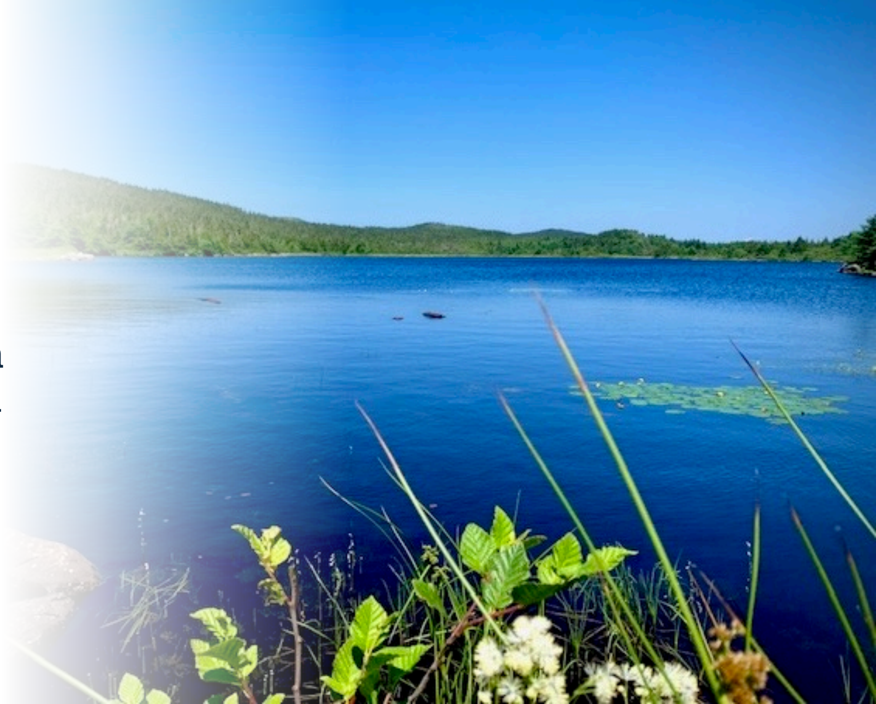
Photo taken from the Walking Trail